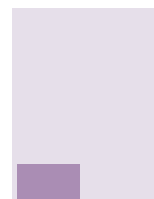
Eighth Page 3.5 X 2"