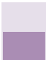
Half Page Horizontal 8.5 X 5.5"