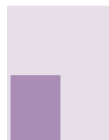
Quarter Page 4.25 X 5.5"